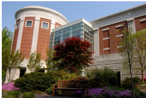
Harold Schiffman Music Library