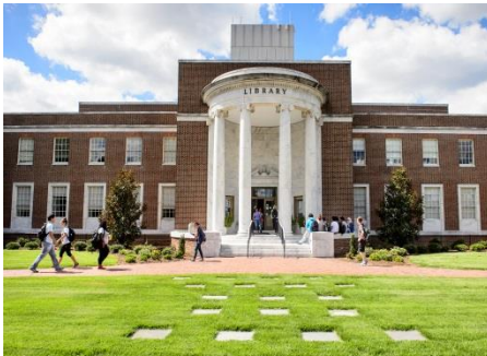
Walter Clinton Jackson Library